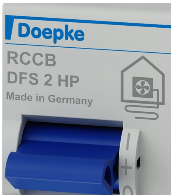
RCCB suitable for HP application

Marking the RCCB with HP symbol aids identification on site